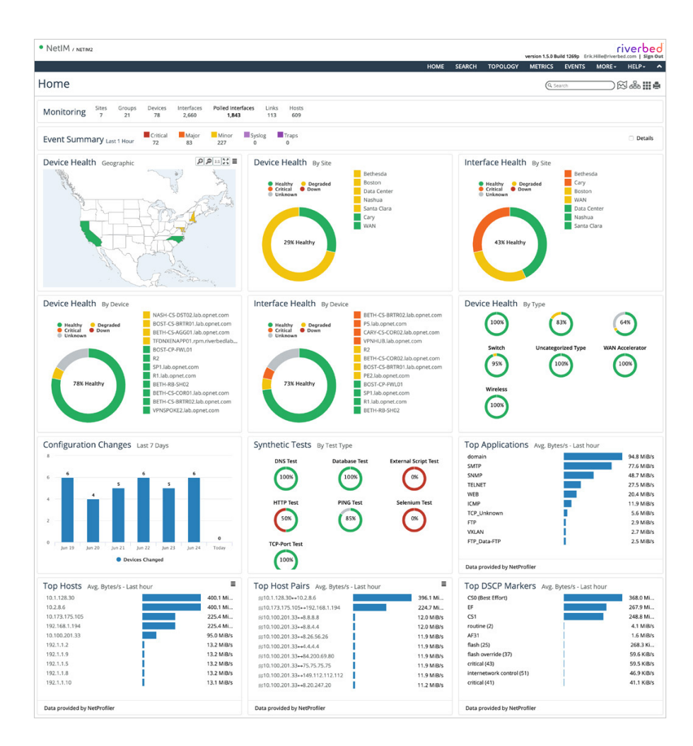
Figure 2: Home page enables you to visualize infrastructure performance by site, device, and by type.