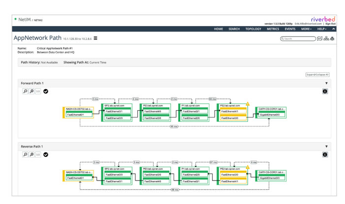
Figure 4: AppNetwork path lets you view application data as it transverses the network.