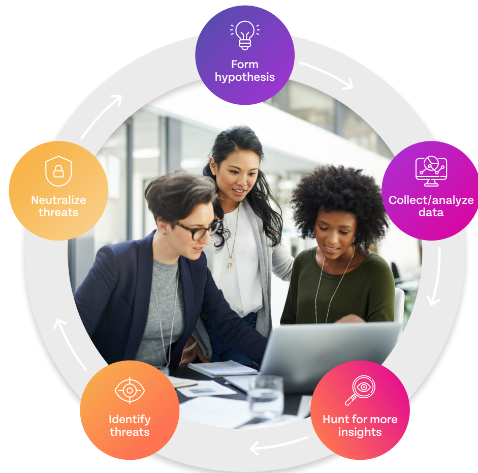
The Threat Hunting Process

Understanding what the bad guys are doing and where they are likely to strike provides the structure needed to threat hunt beyond relying on hunches or putting out fires when something goes wrong.