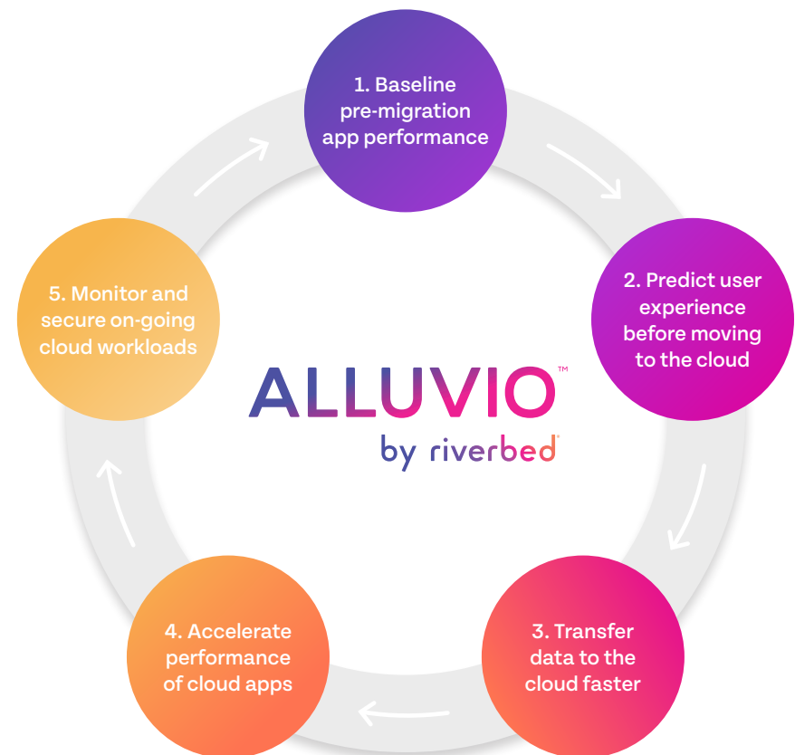
Figure 1: Alluvio complete cloud migration solution from planning to executing to sustaining.

The Alluvio portfolio provides always-on, full-fidelity capture of network traffic to deliver the total visibility necessary for network defense in depth for hybrid environments. SecOps teams leverage this visibility to support three core security management use cases: threat hunting, incident response, and deep forensics analysis.